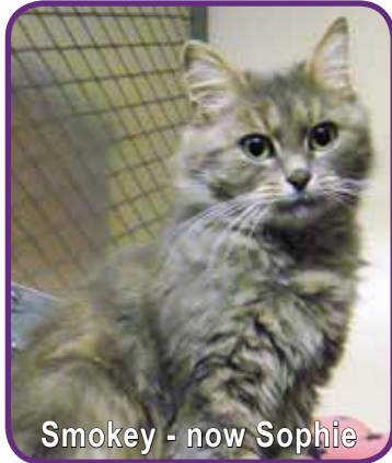
Smokey - now Sophie

S mokey arrived at National Animal Welfare Trust – Thurrock one Sunday morning; having been spotted, apparently lost and alone by the Cat Homing Officer. Staff at the shelter said “Smokey was in a bad condition, biting and scratching at herself as a result of fleas, and had sores on her body, legs and paws, along with a very matted coat. Smokey was checked for a microchip; but sadly, and is often the case, she didn't have one. She visited the vet, who treated her for fleas and worms and prescribed antibiotics for her wounds. Despite all she had been through, Smokey still craved human attention, and thanks to all the love she received at the cattery from both staff and visitors, she made great progress.”